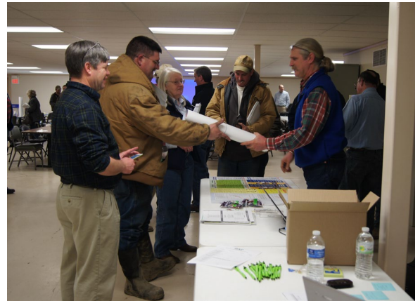
Figure 4: Growers in Kentucky receiving GAP materials at meeting.

Considerable adjustments to trainings were made in Pennsylvania and Maryland due to the culture of the growing community. In Pennsylvania and Maryland, due to the overwhelming predominance of small family farms using only family labor, a condensed version of the Enhanced Labor Training was given by GAPC, and the labor component of training focused heavily on Worker Protections Standards and pesticide safety.