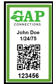
Figure 1: Grower ID Card

Growers who attend a GAP training event have their Grower ID card (Figure 1) scanned at the end of the meeting to capture their attendance by GAPC. This information is viewable by their contracting companies with the grower's permission.