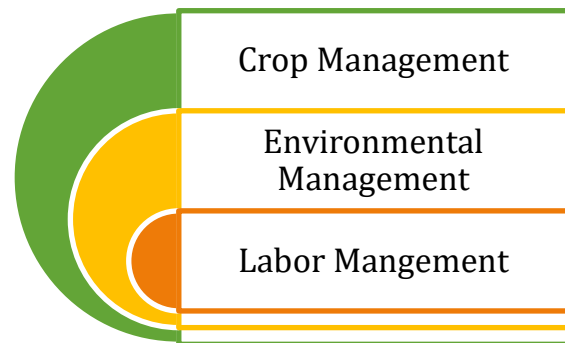
Figure 2: Components of GAP Training

GAPC requires GAP Annual Trainings to have three management topics covered. These include training on best practices in crop, environmental, and labor management. Specific topics within the main components varied by tobacco type and region. GAPC generally has required topics in labor management but allows educators flexibility to choose crop and environmental topics within their areas that best fit their growers' needs.