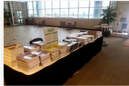
Figure 5: GAP Training Materials that growers receive at meetings.

At the Annual trainings, where GAPC staff was available (about 80% of trainings), a GAPC table is set up for growers with materials such as new registration forms, request for a replacement cards, premium membership forms, additional promotional flyers, and examples of training materials.