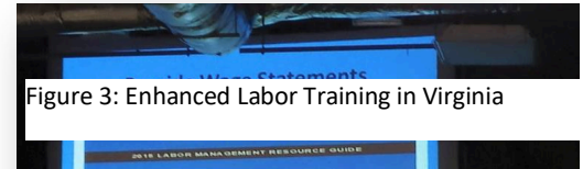
Figure 3: Enhanced Labor Training in Virginia

Considerable adjustments to trainings were made in Pennsylvania and Maryland due to the culture of the growing community. In Pennsylvania and Maryland, due to the overwhelming predominance of small family farms using only family labor, a condensed version of the Enhanced Labor Training was given by GAPC, and the labor component of training focused heavily on Worker Protections Standards and pesticide safety.