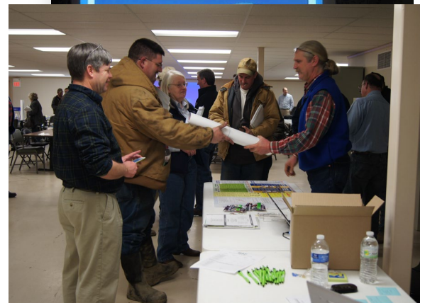
Figure 4: Growers in Kentucky receiving GAP materials at meeting.