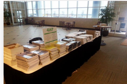
Figure 5: GAP Training Materials that growers receive at meetings.

At the Annual trainings, where GAPC staff was available (about 80% of trainings), a GAPC table is set up for growers with materials such as new registration forms, request for a replacement cards, premium membership forms, additional promotional flyers, and examples of training materials.