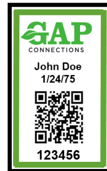
Figure 1: Grower ID Card

Growers who attend a GAP training event have their Grower ID card (Figure 1) scanned at the end of the meeting to capture their attendance by GAPC. This information is viewable by their contracting companies with the grower's permission.