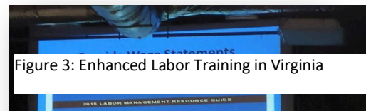
Figure 3: Enhanced Labor Training in Virginia

Considerable adjustments to trainings were made in Pennsylvania and Maryland due to the culture of the growing community. In Pennsylvania and Maryland, due to the overwhelming predominance of small family farms using only family labor, a condensed version of the Enhanced Labor Training was given by GAPC, and the labor component of training focused heavily on Worker Protections Standards and pesticide safety.