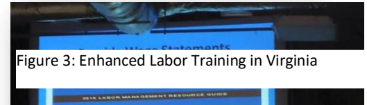
Figure 3: Enhanced Labor Training in Virginia

Considerable adjustments to trainings were made in Pennsylvania and Maryland due to the culture of the growing community. In Pennsylvania and Maryland, due to the overwhelming predominance of small family farms using only family labor, a condensed version of the Enhanced Labor Training was given by GAPC, and the labor component of training focused heavily on Worker Protections Standards and pesticide safety.