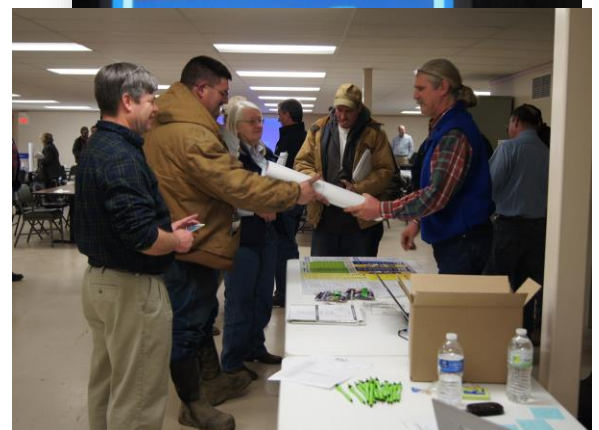
Figure 4: Growers in Kentucky receiving GAP materials at meeting.