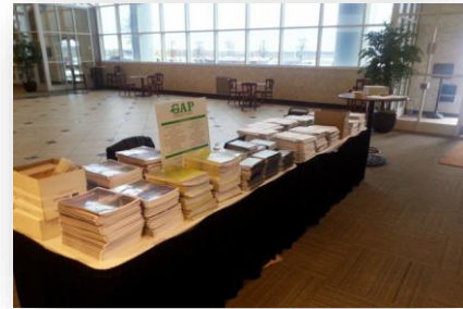
Figure 5: GAP Training Materials that growers receive at meetings.

At the Annual trainings, where GAPC staff was available (about 80% of trainings), a GAPC table is set up for growers with materials such as new registration forms, request for a replacement cards, premium membership forms, additional promotional flyers, and examples of training materials.