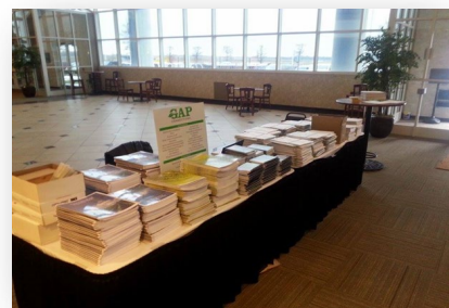
Figure 5: GAP Training Materials that growers receive at meetings.

At the Annual trainings, where GAPC staff was available (about 80% of trainings), a GAPC table is set up for growers with materials such as new registration forms, request for a replacement cards, premium membership forms, additional promotional flyers, and examples of training materials.