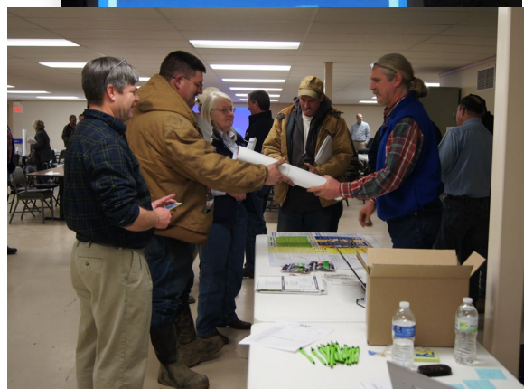
Figure 4: Growers in Kentucky receiving GAP materials at meeting.