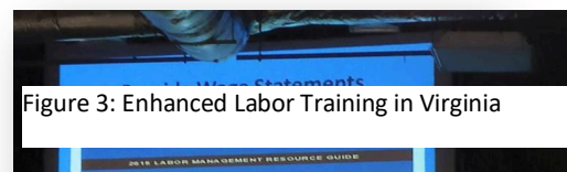
Figure 3: Enhanced Labor Training in Virginia

Considerable adjustments to trainings were made in Pennsylvania and Maryland due to the culture of the growing community. In Pennsylvania and Maryland, due to the overwhelming predominance of small family farms using only family labor, a condensed version of the Enhanced Labor Training was given by GAPC, and the labor component of training focused heavily on Worker Protections Standards and pesticide safety.