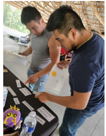
Workers learn about the warnings on CPA labels in Scottsville, Kentucky.