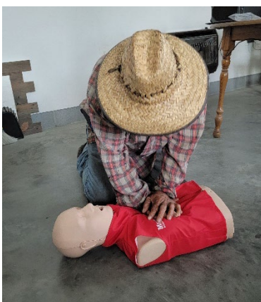
Farmworker practicing CPR during training in North Carolina

The topics workers were trained on include general farm safety, farm equipment and machinery (includes ROPS, PTO, and machine safeguarding), green tobacco sickness-symptoms & treatment, use of personal protective equipment (PPE), farm emergency plan and response, GAPC worker rights and responsibilities, GAPC worker concern helpline, NTRM (Non-tobacco related materials) Prevention, GAPC Certification Crop Integrity (Proper baling and market separation, harvesting tobacco) First aid/CPR, Worker Protection Standards (WPS) pesticide safety, and heat stress. The training methods include using a PowerPoint slides, flipcharts, hands-on training activities, followed by an interactive questions game pertaining to topics covered at the end of training.