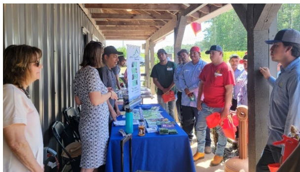
Farmworkers gather around the Virginia Workforce Development table in Virginia.

In Virginia, growers were provided training on topics such as managing farm stress and mental health and an orientation on the new GAPC Housing Training Kit for employer-provided farmworker housing. In North Carolina, growers were provided training on managing farm stress and mental health, heat illness plans, farm emergency & disaster plans, and orientation on the new GAPC Housing Training Kit for employer-provided farmworker housing.