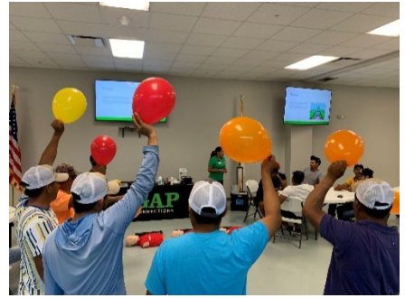
Workers are participating in an activity demonstrating risk in Kentucky.