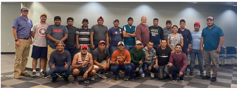
Farm Safety Training in Lexington, Kentucky at Fayette County Extension Office.