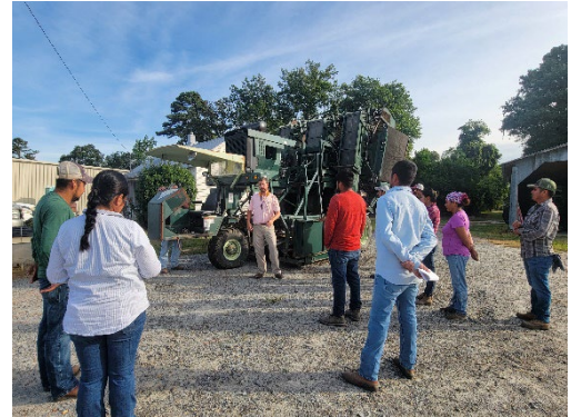
Equipment Safety Training in North Carolina

GAPC is offering its customized farmworker training to any operation that may need safety, health, or compliance training. This broadening of GAPC's reach allowed the organization to engage with other commodities. While the main enterprise on the operations was tobacco, other crops included peanuts, hay pasture, small grains, sweet potatoes, cotton, soybeans, cucumbers, and corn.