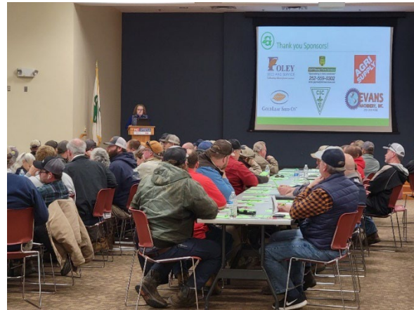
February 2022 Johnston County, North Carolina

GAPC, in partnership with several cooperative extension programs, coordinates annual training meetings where growers learn from experts about the latest crop, environmental, and labor best management practices. Presenters include specialists in crop and environmental topics such as university agronomists, entomologists, plant pathologists and specialists in labor topics, including representatives from the federal Department of Labor, Wage and Hour Division and certain state departments of labor.